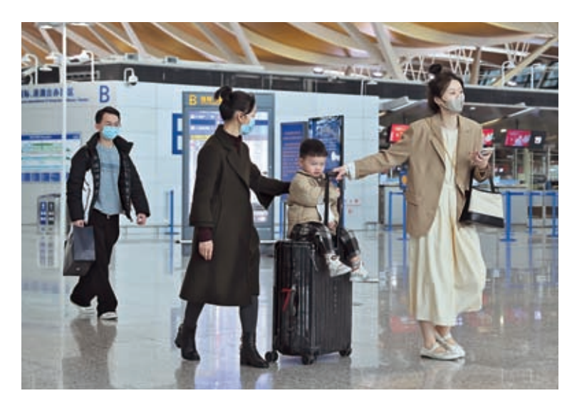
Overseas-bound passengers at the Shanghai Pudong International Airport.

The airline has joined hands with travel agencies and launched group excursions from Guangzhou in southern Guangdong Province to New Zealand, the Philippines, Cambodia, Laos, Malaysia, Thailand, Singapore, Indonesia, Kenya, the Maldives,